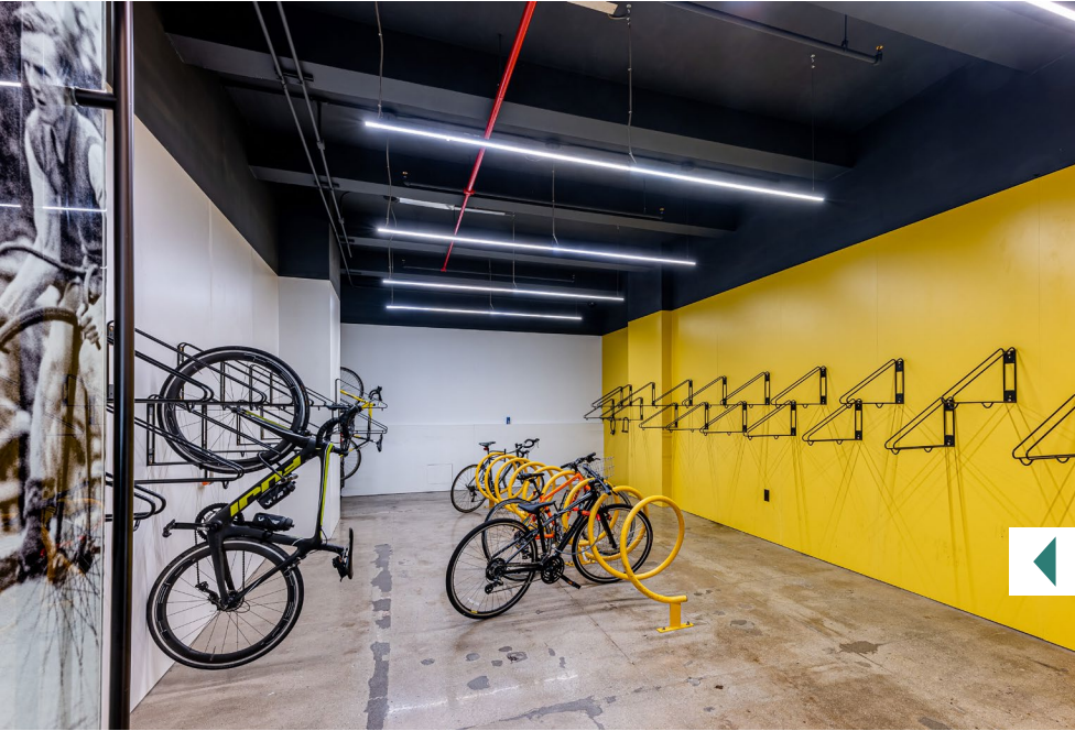
◀ Bicycle Storage Room